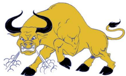
Ersilia Cruz Middle School